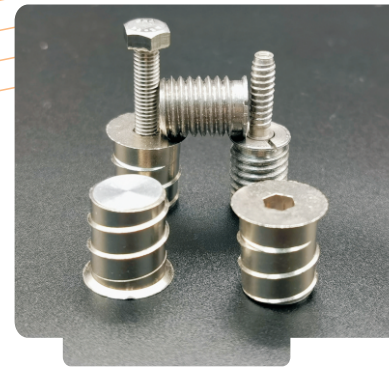
New product design and development

Xintegu: Innovate the intelligent manufacturing of hardware and face the development of the world.