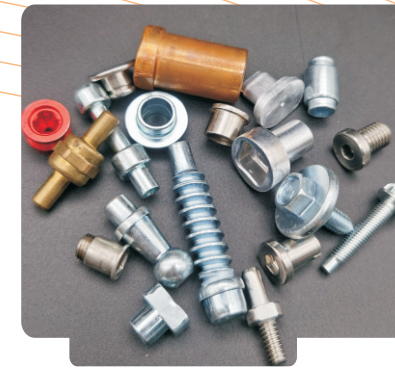
Challenge Cold Heading High Difficulty Products